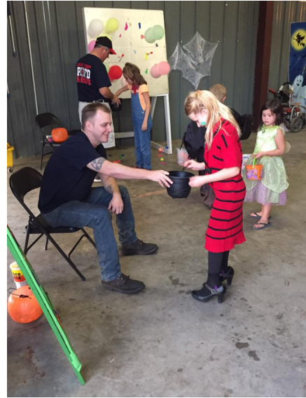
Bean Bag Toss