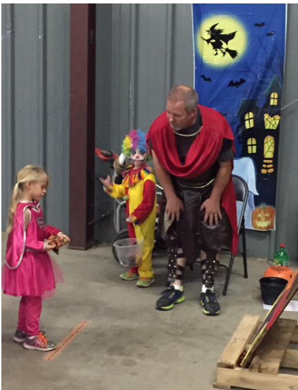
Bean Bag Toss